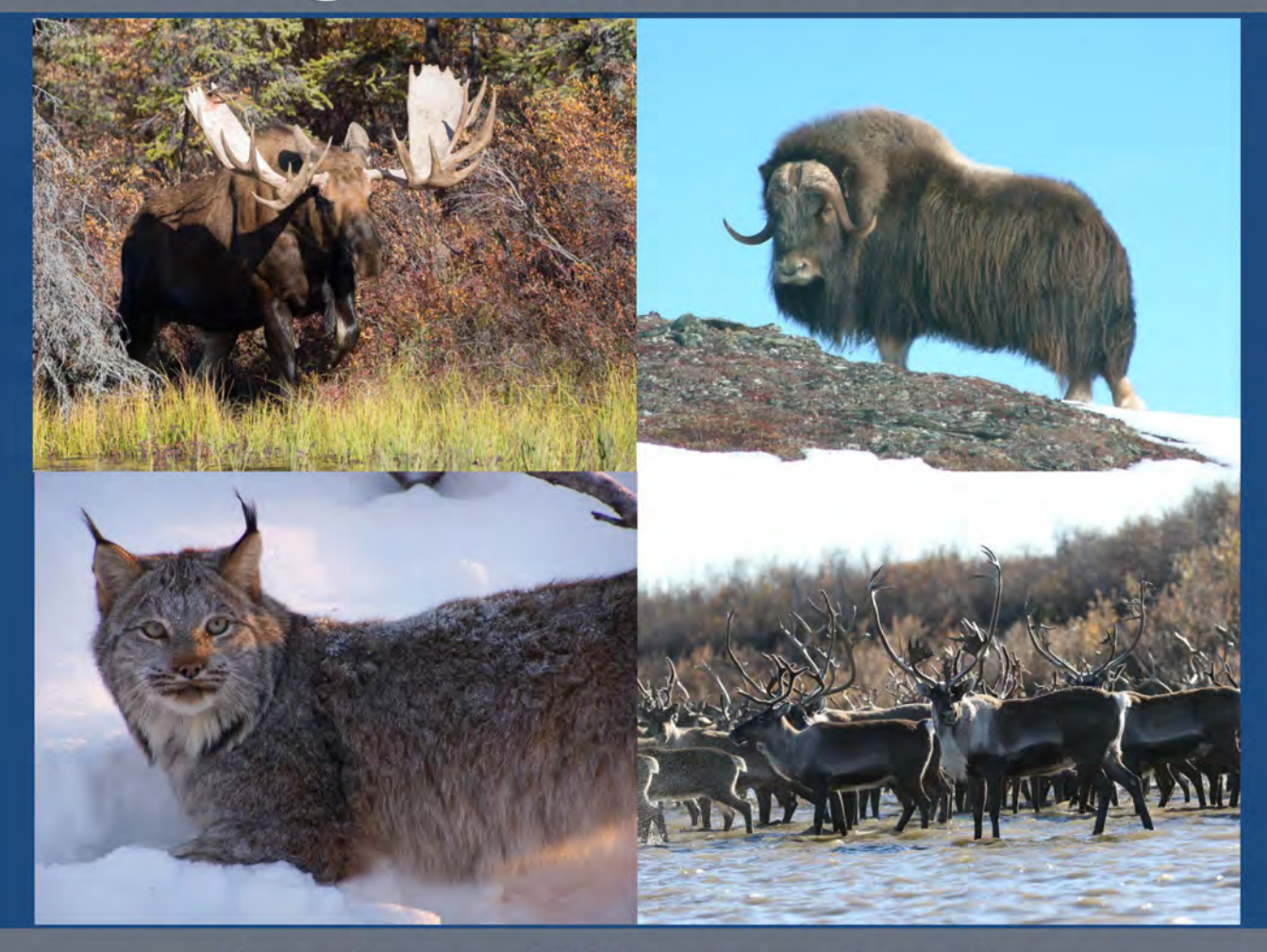
Arctic and Western Region Game Management Units 18, 22, 23 and 26A