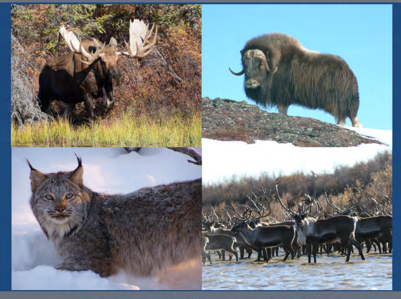
Arctic and Western Region Game Management Units 18, 22, 23 and 26A